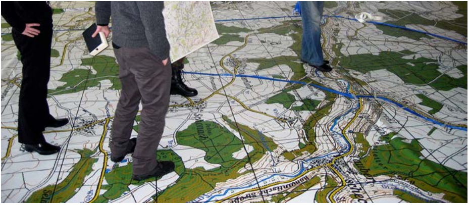
Figure 9 Swiss military map at army training facility depicting German territory, Thun, 2005