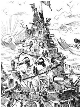
Figure 4 Caricature entitled 'After the Gotthard, the Matterhorn', published in the satirical weekly Der Nebelspalter , November 19, 1887

While of vital significance during World War II, the réduit dates back to the early 19th century and later gained importance in connection with the Gotthard railroad tunnel built in 1882 (Stamm, 2003). And this was no coincidence as the Gotthard Pass lies at the heart of the country and forms the key link between north and south. A caricature published at that time entitled 'After the Gotthard, the Matterhorn' ironically shows the ramifications of the Alps conceived as weapon (figure 4 & 5).