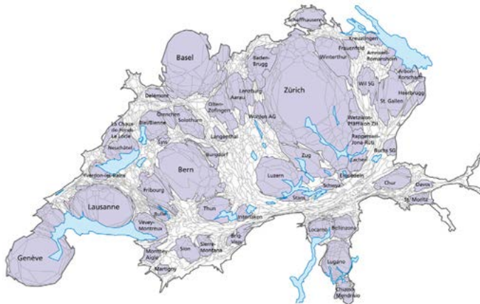
Figure 8 Anamorphic map of Swiss agglomerations registering different population densities of communities in the country, 2000 (courtesy of Jacques Lévy, Chôros Laboratory, EPFL)

By now a well-known phenomenon and one that has plagued scores of scientists, geographers, engineers, planners, and politicians alike, entropy, or the tendency of a system toward spontaneous change, has spawned ever new tools to get a handle on a condition that by definition resists control. From GIS technology and anamorphic mapping to spatial statistics and morphological modelling, empirical data are crunched into what has effectively become our contemporary version of landscape painting, all diagramming urbanity without pause. With due respect, such labour faces the Sisyphean task of trying to contain cities and their metropolitan regions. As composed as it might appear, Switzerland's urban fabric no longer yields to an immaculate image, whether idealised on a map or rationalised in the mind. Quite the contrary, although clean and efficient, this urbanised country manifests an amalgam of disjunctive bits and pieces, each operating according to their own rules and agendas (figure 8).