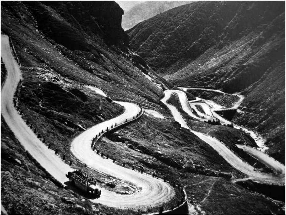
Figure 5 Via Tremola, Old St. Gotthard Road, south side of the St. Gotthard Pass, 1928

Thoroughly excavated by caverns and encrusted with roads and cannons, the mountain becomes a technological object. During World War II, defence construction further escalated with considerable investments made in building more fortifications, which to some degree are still used by the army today. Henri Guisan, General of the armed forces during the war and no doubt a role model for Blattmann, reanimated the national call for resistance in the spirit of the réduit (Kurz, 1965). He declared in July 1940 that in case of attack by Axis forces, the Swiss would defend the high Alps and its infrastructure above all. To get a sense of the scale of the operation, 40 000 fortresses and subterranean installations were built during the war alone (Kurz, 1965: 77). Whereas the majority of these structures form extensive hidden networks, they most often surface in the landscape as idyllic, yet fake chalets, camouflaged as quotidian domestic architecture (Schwager, 2004). The Alps have been literally hollowed to become an infrastructural armature for national defence. The image of a perforated mountain range, not unlike Swiss cheese, increased the mythical power of the réduit as the last bulwark of territorial resistance (Kreis, 2010: 182) (figure 6).