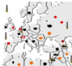
Figure 3 Map presented to the Swiss Parliamentary Security Council by Chief of the Armed Forces André Blattmann, 2010

Case in point, a simple map can make a mountain out of a molehill. A media event in early March 2010 unleashed a firestorm in Switzerland, a country again long known for its understated political neutrality. The Swiss press released a military map positioning the small nation in the middle of hostile territory. Europe is portrayed as a battleground with threatening starburst symbols, tanks, nuclear missiles, and dollar signs spotting the continent. By contrast, the centre, marked by the little white cross on a red background – by now a brand of anything Swiss –, poised to defend the land's fragile peace. In place of natural terrain, the map's geography is drawn in game-board-relief of accentuated national borders rendered as deep ravines separating countries, with Switzerland cast as fortress. The map's legend is quite telling: orange starbursts stand for those states posing a threat arising from political, ethnic, and religious clashes, red starbursts denote post-9/11 terrorist attacks on European soil, black starbursts identify areas of social unrest, nuclear missiles indicate neighbouring countries with weapons of mass destruction, tanks symbolize regions torn by armed conflict, and perhaps no less menacing, the dollar sign represents nations with unstable economies. Europe is a scary place (figure 3).