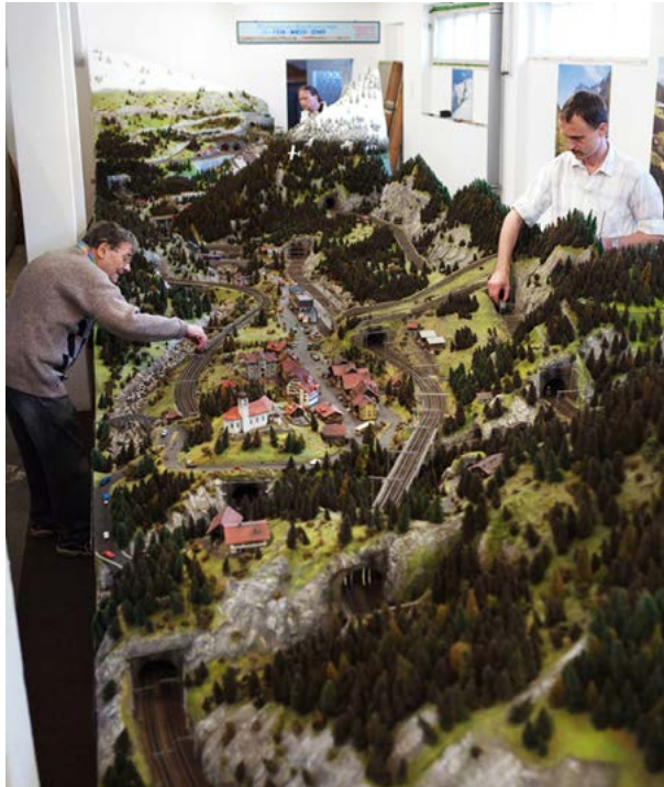
Figure 2 Model Train of the Gotthard North Ramp (scale 1:120), Model Train Club Leipzig, DDR, 1969-89

nados who had never visited the actual site (figure 2). Though born of fantasy, the project required up-to-date maps that were smuggled in and used to plot an elaborate duplicate of the real setting, one replete with rock formations, trees, lakes, snow, and not to forget those Swiss chalets and all the other necessary technical amenities for a picture-perfect, Heidi-esque set. What was undertaken as an innocent leisurely pursuit eventually got the East German hobbyists in trouble with agents from the Ministry for State Security, more commonly known as the Stasi, who were suspicious of the clandestine operation. But the story had a happy ending, as the maps used were deemed harmless by authorities and the co-opted image of Switzerland deemed benign.