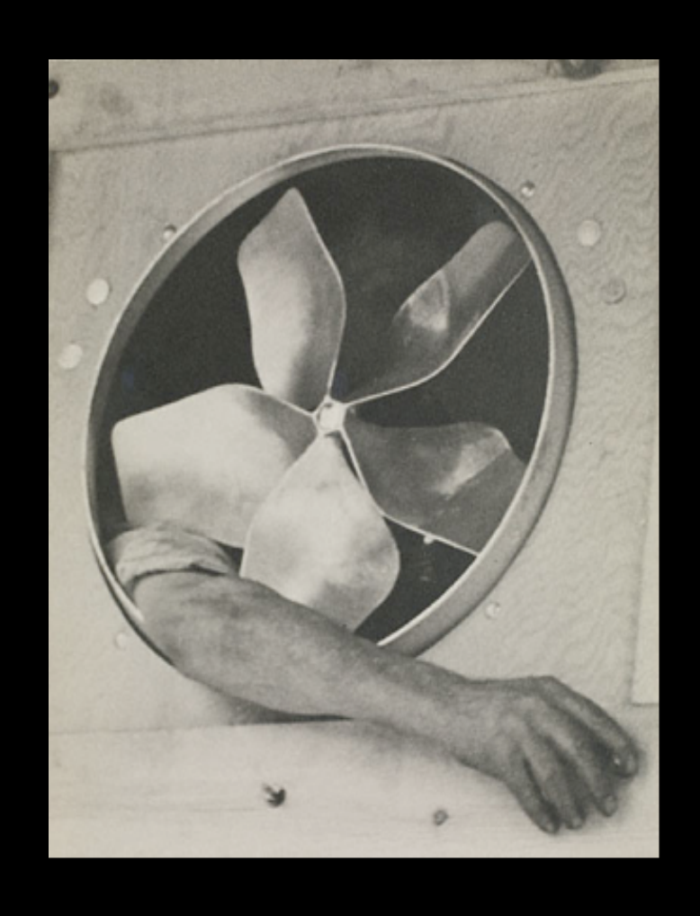
"Arm and Ventilator, New York," 1937 Estate of André Kertész