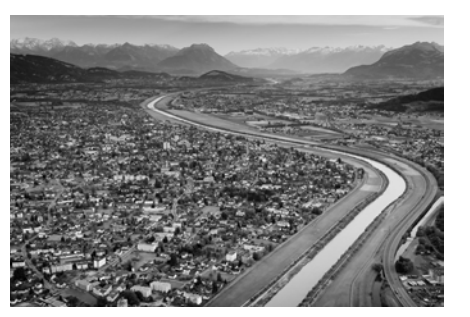
Medium dense urbanisation (Rhine valley close to the lake Constance)

traditionally compact and dense city cores sophisticated building laws and licence agreements have been developed and negotiated over the centuries to allow the coexistence of a broad variety of activities. This legal groundwork is one of the basic foundations of the cities' urbanity. Such negotiation processes will have to be conducted for the entire territory, including the uninhabited areas, in the future.