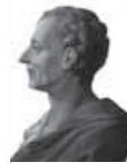
Baron de La Brède et de Montesquieu (1689 Bordeaux, 1755 Paris)

he achieved literary success with the publication of his lettres persanes, a satire based on the imaginary correspondence of a persian visitor to paris, pointing out the absurdities of contemporary society