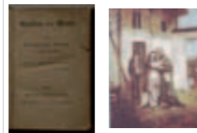
1779 Nathan der Weise Gotthold Lessing religious tolerance

nathan compares the religion, judaism, islam and christianity. he is saying that each of us lives by the religion we have learned from those we respect.