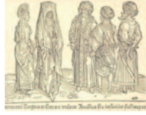
1486 peregrinato in terram sanctam erhard reuwich