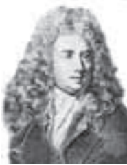
Antoine Galland (1646 Rollot, 1715 Paris)

was a French orientalist and archaeologist first translator of 1001 nights