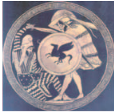
5th century BC greek hoplite and persian warrior depicted fighting. ancient kyllix.

"arab" is defined independently of religious identity, and pre-dates the rise of islam, with historically attested arab christian kingdoms and arab jews. the earliest documented use of the word "arab" as defining a group of people dates from the 9th century bce.[14] islamized but non-arabized peoples, and therefore the majority of the world's muslims, do not form part of the arab world but comprise what is the geographically larger and diverse muslim world.