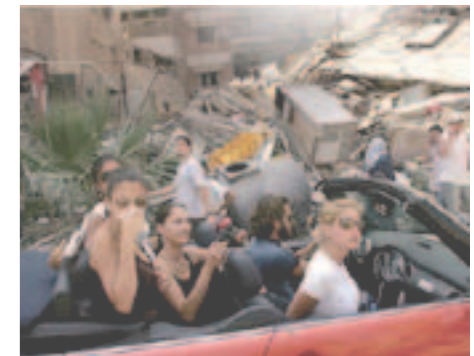
2007 Platt Spencer World Press Photo 2007 Young Libanesen In Beirut