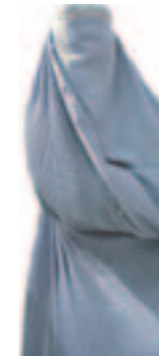
Burka (Burqa, Barqa, Birqa) Kabul Art Galerie