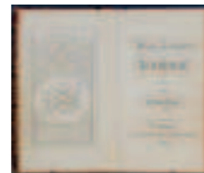
1815 West-Östliche Divan influential model for religious and literary syntheses between the ,orient' and the ,occident'

was a german writer, philosopher, dramatist, publicist, and art critic