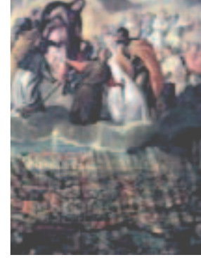
1581 Apotheose der Schlacht von Lepanto (1571) Paolo Caliari