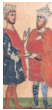
Frederick II (left) meets al-Kamil