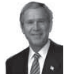
Georg W. Bush (1946 Texas)

after september 11, Bush announced a global war on terrorism . the Afghan Taliban regime was not forthcoming with osama bin Laden, so Bush ordered the invasion of afghanistan to overthrow the Taliban regime.[188] in his January 29, 2002 State of the Union address, he asserted that an "axis of evil" consisting of North Korea, Iran, and Iraq was "arming to threaten the peace of the world" and "pose[d] a grave and growing danger".