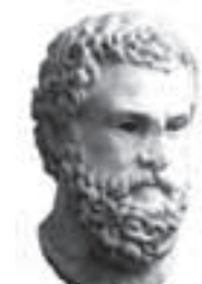
Aeschylus 472 bc

democracy against monarchy he magnifies the invader and upholds athenian democracy against persian monarchy. the military successes of the Greeks, the „victory of western intelligence and liberty over the materialism and despotism of the orient.“