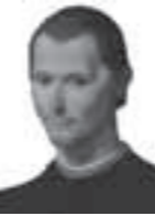
Niccolò Machiavelli (1469 – 1527 Florence)

with the growing power of the ottomans the journey to the east was no longer only pious (pilgrimage) or commercial (trade) but took on the task of observation - today called espionage - to evaluate the opposing power. Niccolo Machiavelli was one of the politicians