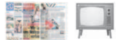
2001 Georg W. Bush

American literature-theorist und- critic of Palestine origin