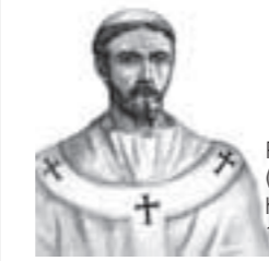
Pope Urban II, (ca.1035 northern France, 1099 rome)

at the assembly he spoke to the people and explained, that the holy land was henceforth under the influence of a profane nation, that the temple of the lord had become possession of the devil and that the laws of pure belief had to be subservient for the pagan superstition. church was under the authority of the ones who did not have a share of the resurrection, but of those who will have to serve for the maintenance of the everlasting infernal fire. the good people were forced to impurity by the dogs, which invaded god's heir.