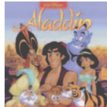
1992 Aladdin Walt Disney Feature Animation.