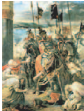
1840 Conquest of Constantinople 1204 Eugène Delacroix

HOW THE 'ORIENT' WAS SEEN AND IMAGINED BY THE WEST