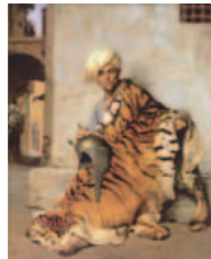
1869 Pelt Merchant of Cairo Jean Leon Gérome