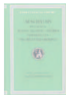
472 bc, Aeschylus' The Persians , a play

democracy against monarchy he magnifies the invader and upholds athenian democracy against persian monarchy. the military successes of the Greeks, the „victory of western intelligence and liberty over the materialism and despotism of the orient.“