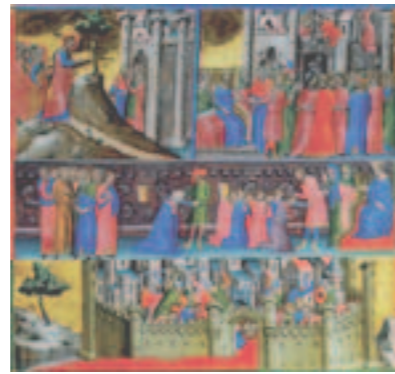
the description had started in 1200 in England and was concluded in the 14 th century in spain