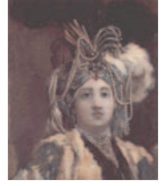
1748 Sultanin Joseph Marie Vien