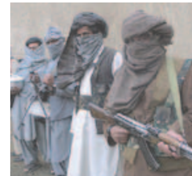
2006 Taliban