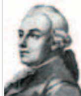
Gotthold Ephraim Lessing (22 January 1729 – 15 February 1781)

nathan compares the religion, judaism, islam and christianity. he is saying that each of us lives by the religion we have learned from those we respect.