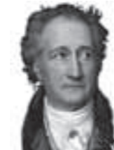
Johann Wolfgang Von Goethe , 1749 – 1832

the work was inspired by the Persian poet Hafiz. the book can be seen as a symbol for a stimulating exchange and mixture between orient and occident while the expression west-eastern does not only refer to german- middle-eastern, but also latin-persian, christian-muslim stimulus. the attempt was to bring orient and occident together.