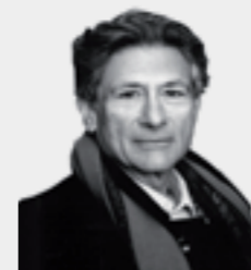
Edward Said, (1935 Palestine, 2003 New york)

in the book, said says that orientalism, especially the academic study of, and discourse, political and literary, about the arabs, islam, and the middle east that primarily originated in england, france, and then the united states actually creates a divide between the east and the west .